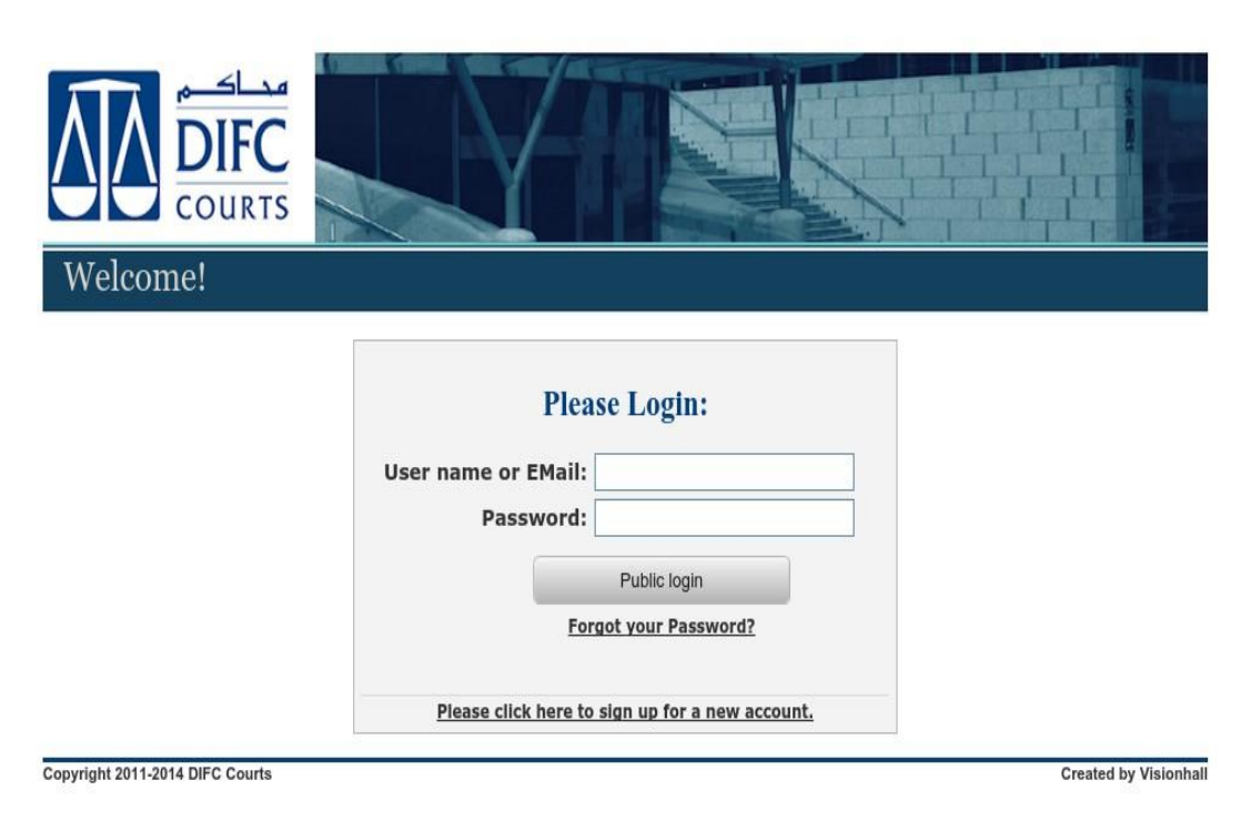
Figure 4.1: DIFC Court log-in page

On final submission of any petition or application through the e-filing system, a text-searchable portable document format of the petition or application should be generated along with a unique case number. The ultimate objective of the e-filing system should be to allow parties to file their petitions, applications and supporting documents online 24x7 from any location without any physical interaction with the tribunal and its staff. Figure 4.1 and Figure 4.2 show the log-in pages of the e-filing systems of the Dubai International Financial Centre (DIFC) court and the Federal Court of Australia respectively.