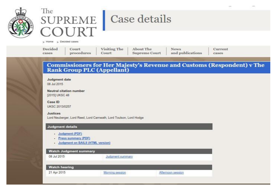
Figure 4.3: UK Supreme Court case details web page format

part heard. Every judicial hearing must be audio-visually recorded and published.<sup>11</sup> Every order of the tribunal must be immediately made available online. After the final disposal of a matter, all petitions, applications and orders pertaining to that matter must be made available online on a single web-page publicly accessible free of charge. All such web-pages must be arranged in a systematic manner to allow anyone to search for a specific matter by is unique number, parties' name etc. Figure 4.3 shows the summary page of a recently decided matter before the UK Supreme Court.