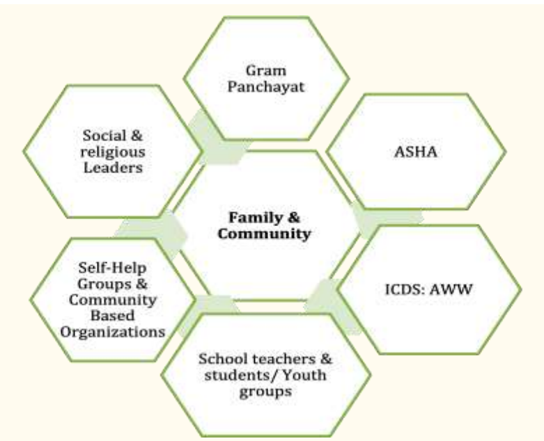
Fig. 1. Key stakeholders within the village community that could be mobilized for COVID-19 management