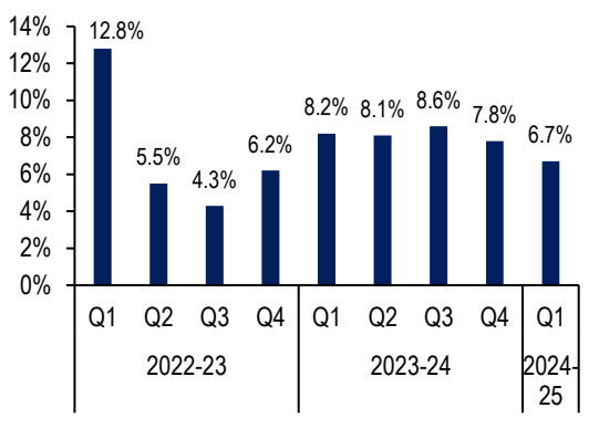
Figure 1: GDP growth at constant 2011-12 prices (in %, year-on-year)